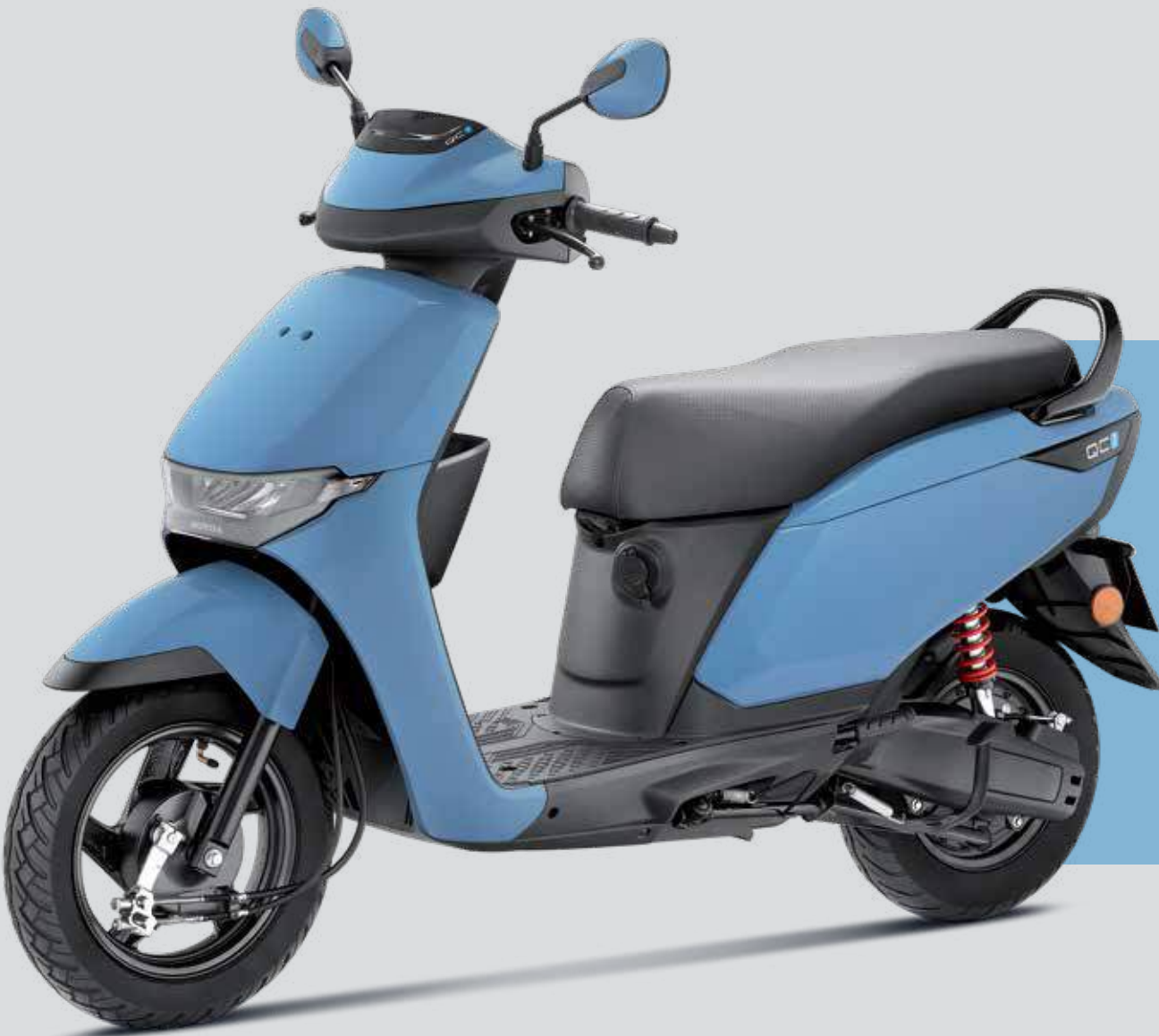
Pearl Serenity Blue

Choose from a range of stunning colours that reflect your personality.