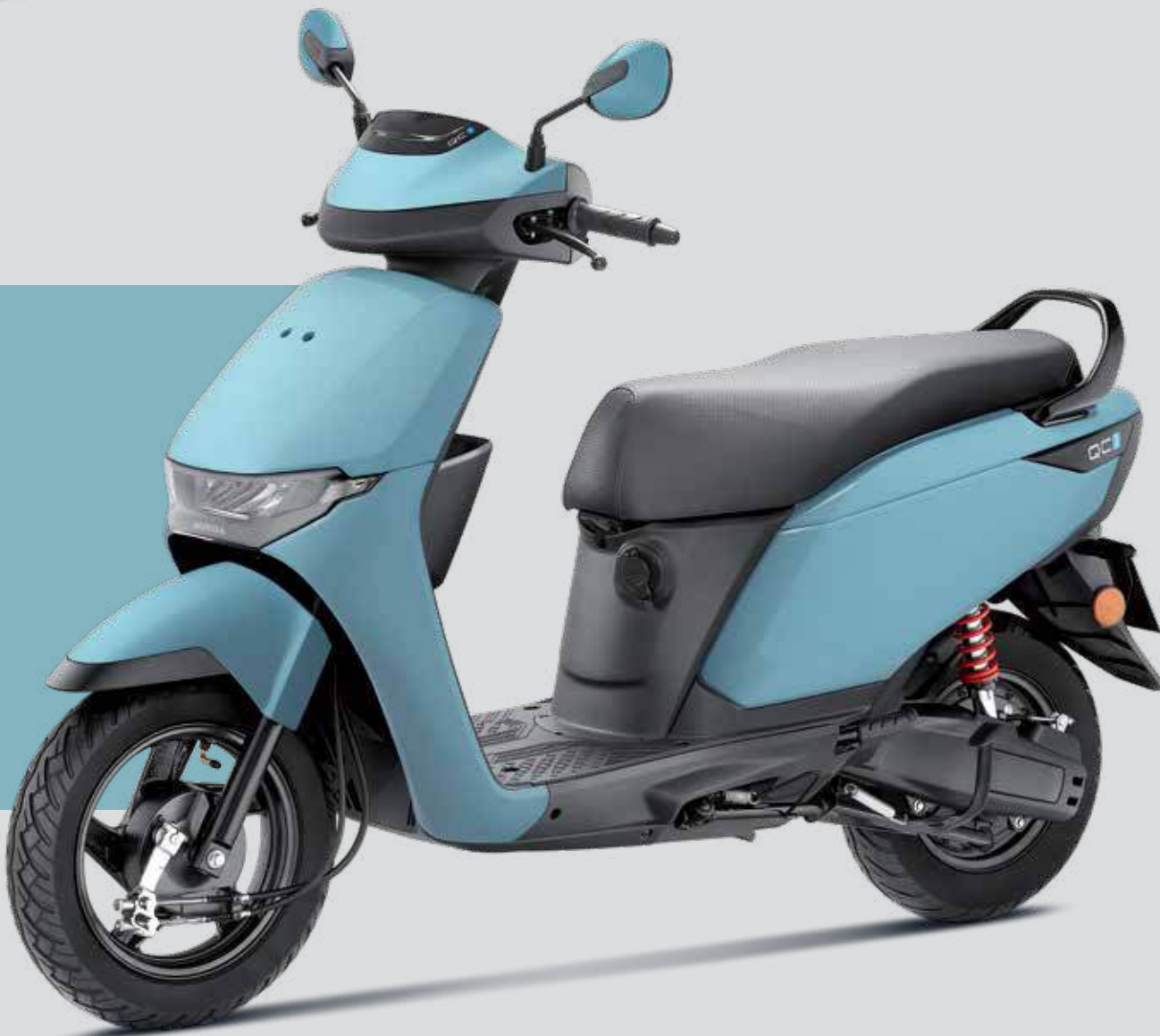
Pearl Shallow Blue