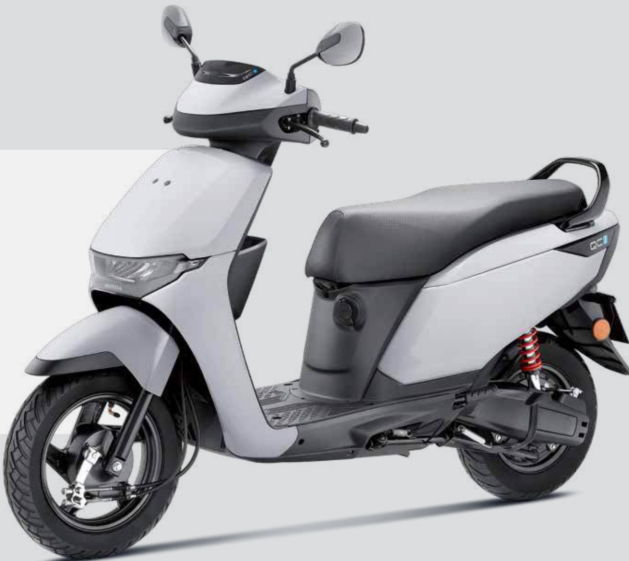
Pearl Misty White