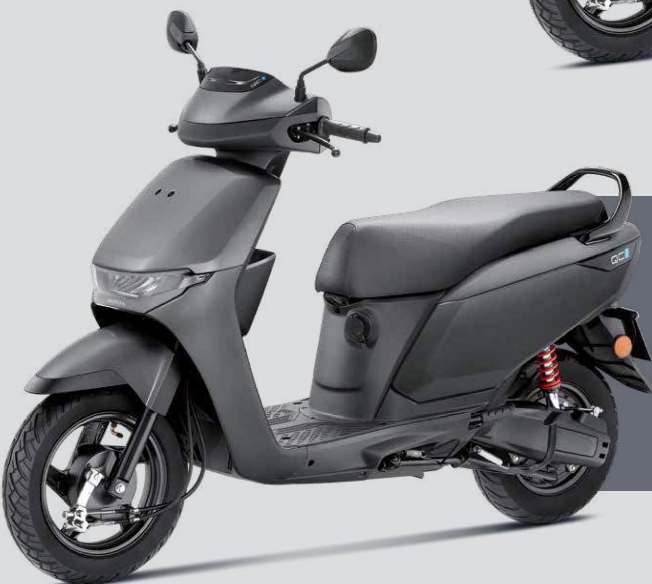
Matt Foggy Silver Metallic